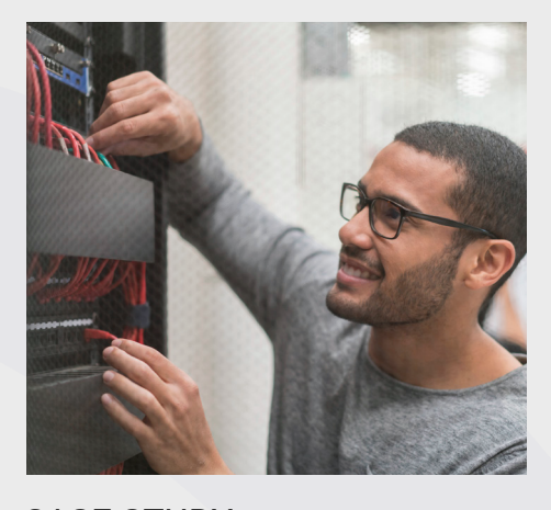
CASE STUDY INDUSTRY: Technology Services