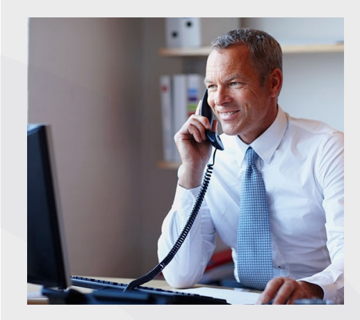
CASE STUDY INDUSTRY: Legal Services