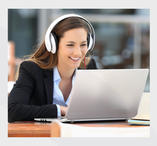
CASE STUDY INDUSTRY: Manufacturing, Retail